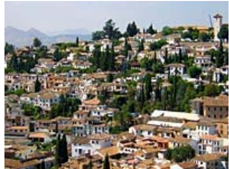
View of The Albayzin – the old Arabic quarter of Granada.

It is of great advantage for trainees to stay in the hospedería as you will be working on the same course together, and it will help you bond, encourage, learn from, and help each other, and also, not to get distracted from your goal, your international TEFL certificate!